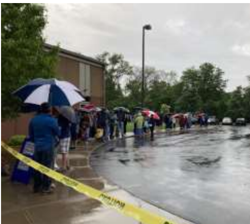
People waiting for 8 am in the rain. Getting in early was that important to them.