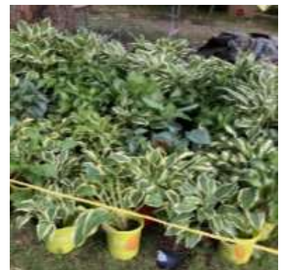
Beautiful hostas wait to be purchased in the plant sale which yielded $3,663